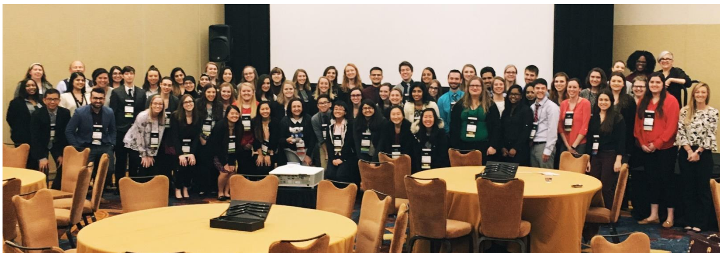
Photo: Mental Health First Aid participants at CPNP 2018 in Indianapolis, IN

More information about the pre-meeting workshop options available at CPNP 2019 , including the suicide assessment, prevention and documentation workshop designed for residents and pharmacists, can be found online.